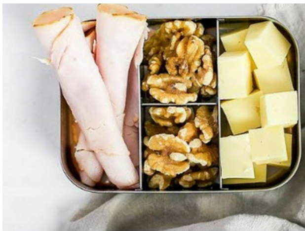
Turkey & Cheese Snack Box