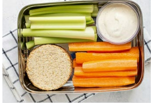
Baba Ganoush Bento Box