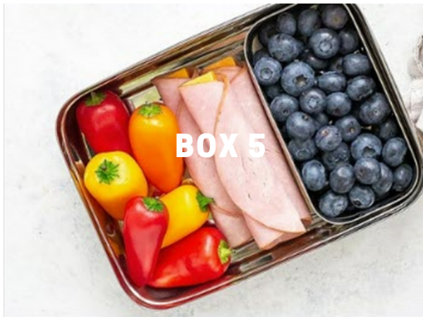
Ham & Cheese Rolls with Mini Peppers