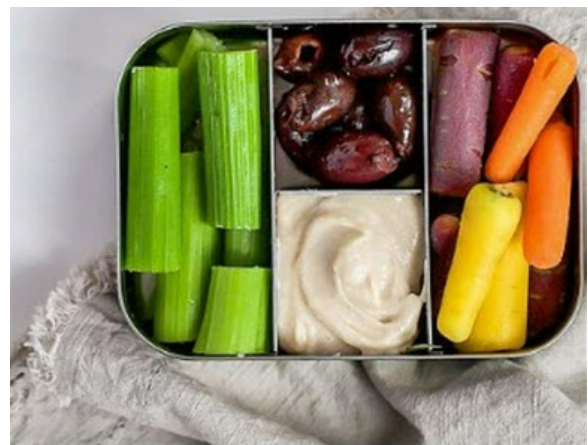
Carrots, Celery & Olives Snack Box